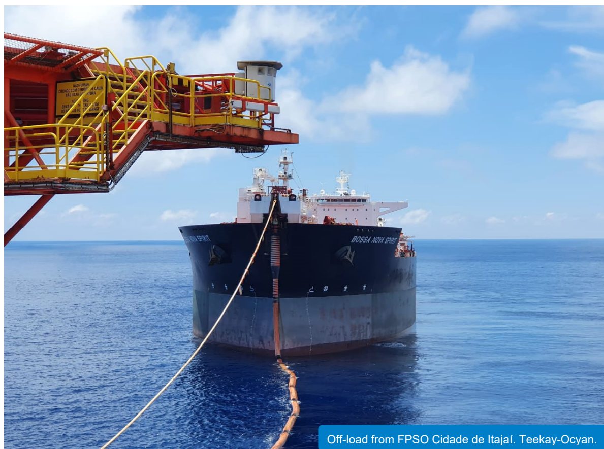
Off-load from FPSO Cidade de Itajaí. Teekay-Ocyan.