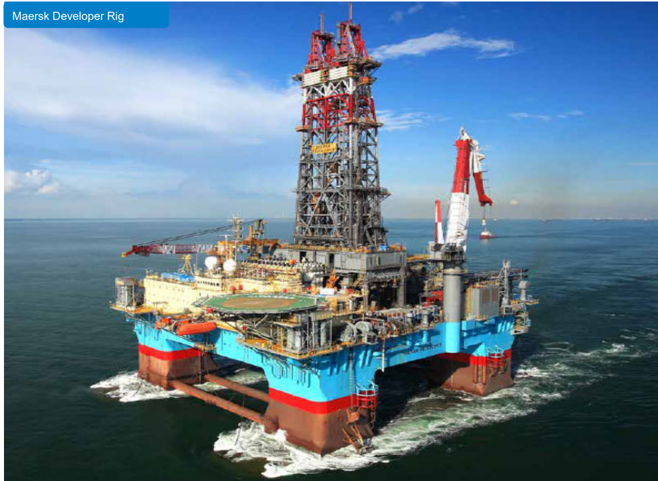
Maersk Developer Rig

The increase to the overall BM-S-40 oil production rates expected to result from these planned activities is approximately 15,000 to 22,000 bopd, which will be partially offset by natural production decline.