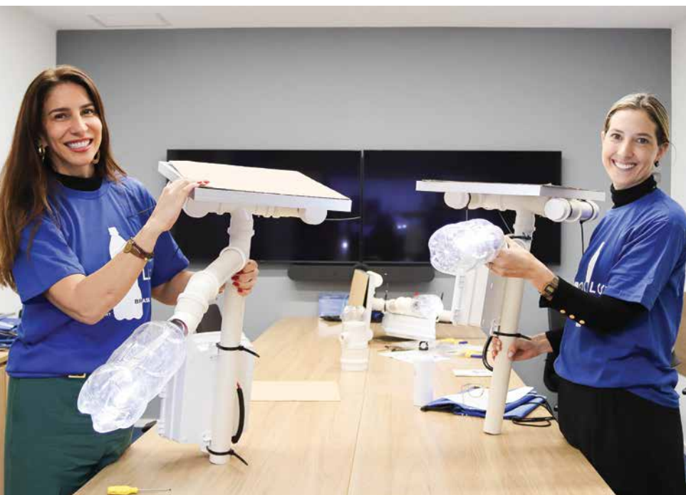
Volunteers from the Rio office for the Liter of Light project.

During the second half of 2023, these projects supported Karoon's commitment to prevent significant environmental impacts from production operations at the Baúna field.